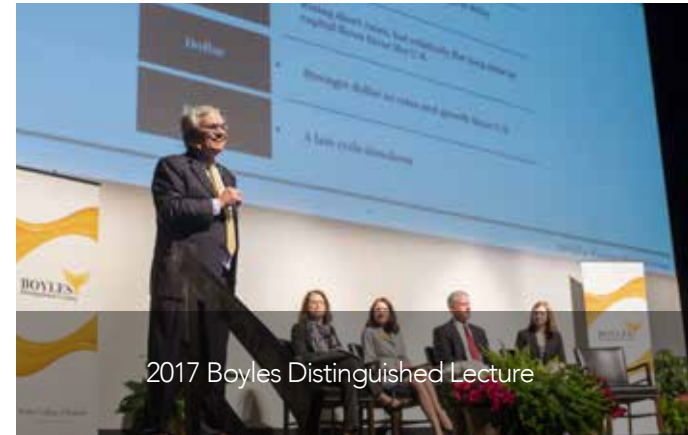
2017 Boyles Distinguished Lecture

For those who wish to continue their business education at Appalachian's graduate level, the Walker College offers accelerated MBA, part-time evening MBA, MS in Applied Data Analytics and MS of Accounting degree programs. The college also offers industry professionals the same transformational experiences afforded to Walker College undergraduate and graduate students through an executive education program.