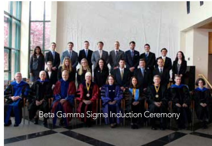
Beta Gamma Sigma Induction Ceremony