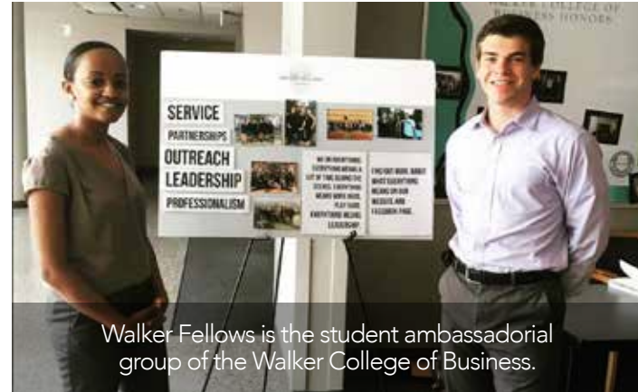
Walker Fellows is the student ambassadorial group of the Walker College of Business.

The Women of Walker program helps accelerate professional development, personal growth, and leadership abilities for female business majors at Appalachian through networking, career exploration, travel opportunities and professional development workshops and seminars.