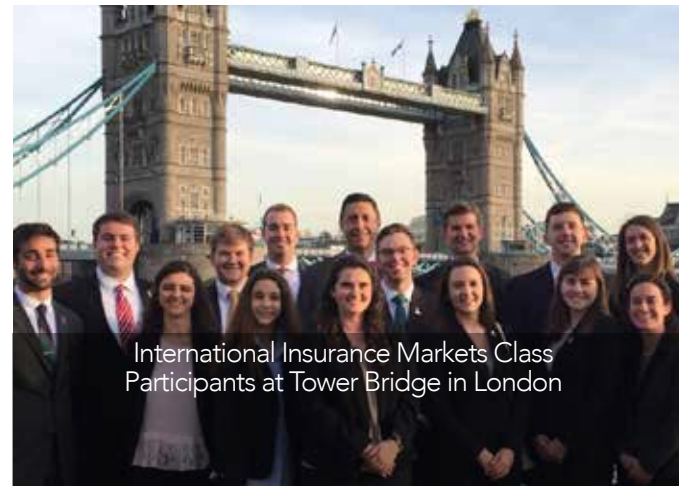
International Insurance Markets Class Participants at Tower Bridge in London