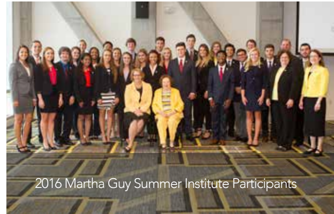
2016 Martha Guy Summer Institute Participants

Appalachian's Risk Management and Insurance Program is one of the largest in the country, and the college's Brantley Risk and Insurance Center, founded in 1988 with support from the Independent Insurance Agents of North Carolina, facilitates interaction between students, faculty and the professionals in the insurance industry. The Brantley Center is one of five centers in the college that engages students outside of the traditional classroom setting. The others are the BB&T Student Leadership Center, the Transportation Center for Entrepreneurship, the Center for Economic Research & Policy Analysis (CERPA) and the Center for Analytics Research & Education (CARE).