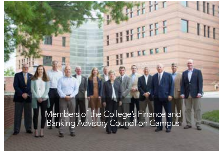
Members of the College's Finance and Banking Advisory Council on Campus