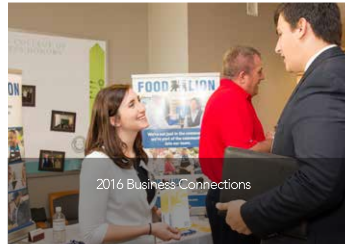
2016 Business Connections