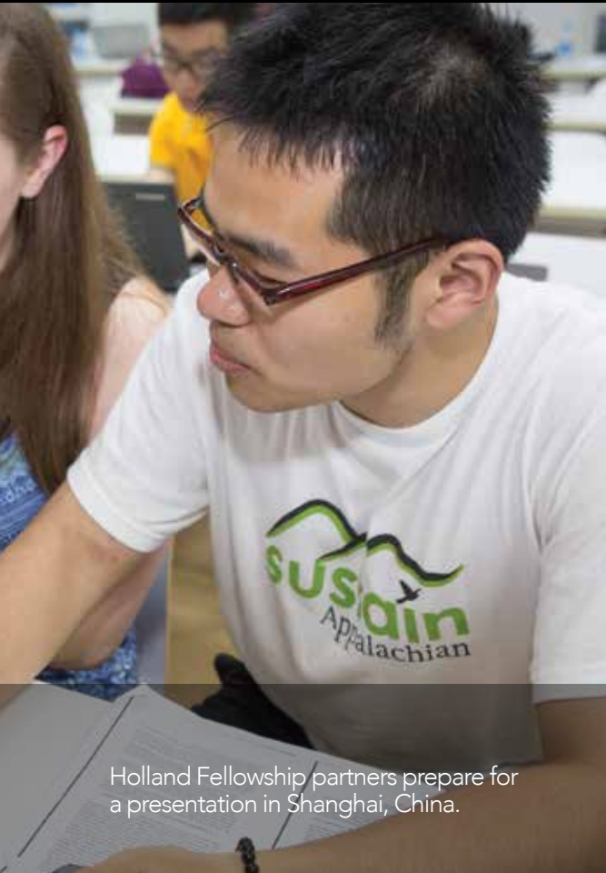
Holland Fellowship partners prepare for a presentation in Shanghai, China.