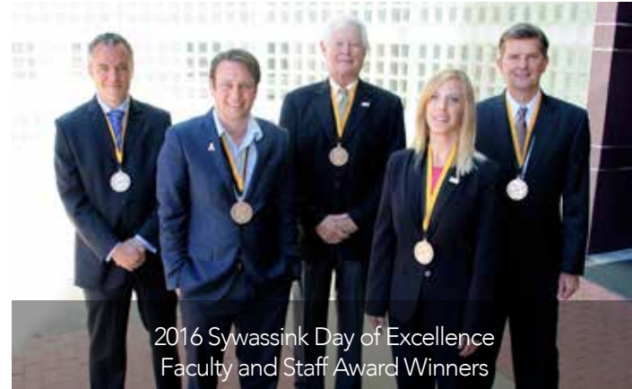
2016 Sywassink Day of Excellence Faculty and Staff Award Winners

Opportunities are provided for students to interact with members of the college's eight advisory groups, including the college-level advisory group, the Business Advisory Council. Advisory groups are composed of business leaders who meet regularly to advise Walker College administrators on matters relating to the needs of the business community. The businesses represented by the members are diverse and include major accounting, manufacturing, banking, insurance, law, financial, advertising, retail, management consulting and health care firms.